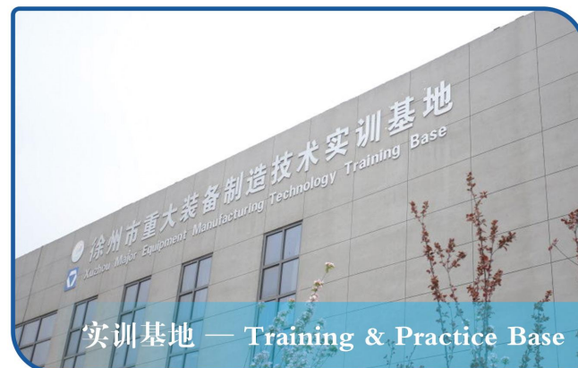
实训基地 — Training & Practice Base