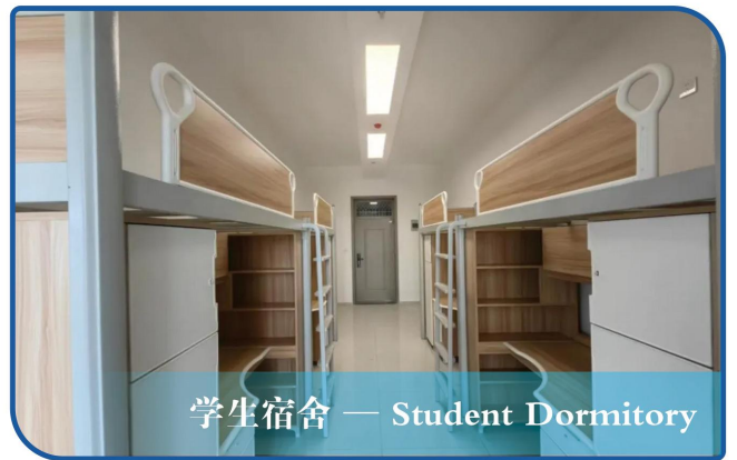
学生宿舍 — Student Dormitory