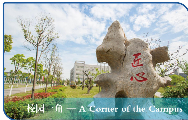
校园一角 — A Corner of the Campus