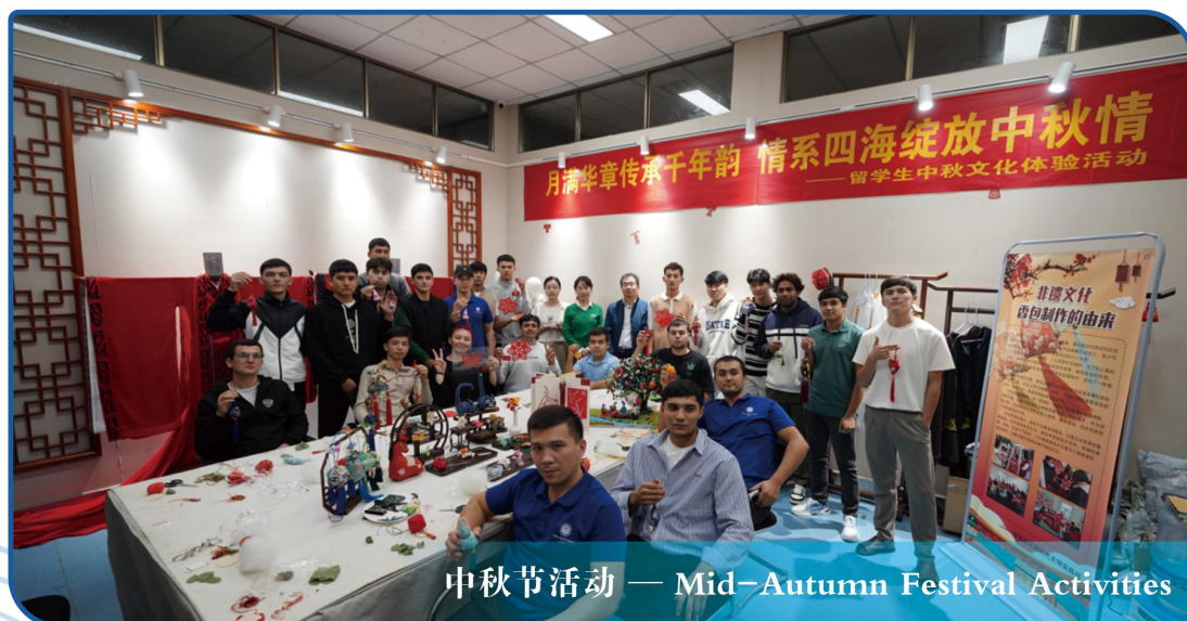
中秋节活动 — Mid-Autumn Festival Activities