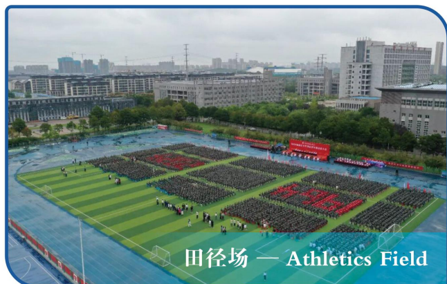
田径场 — Athletics Field