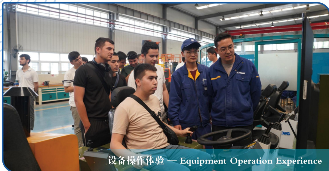
设备操作体验 — Equipment Operation Experience