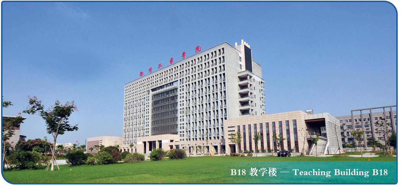
B18 教学楼 — Teaching Building B18