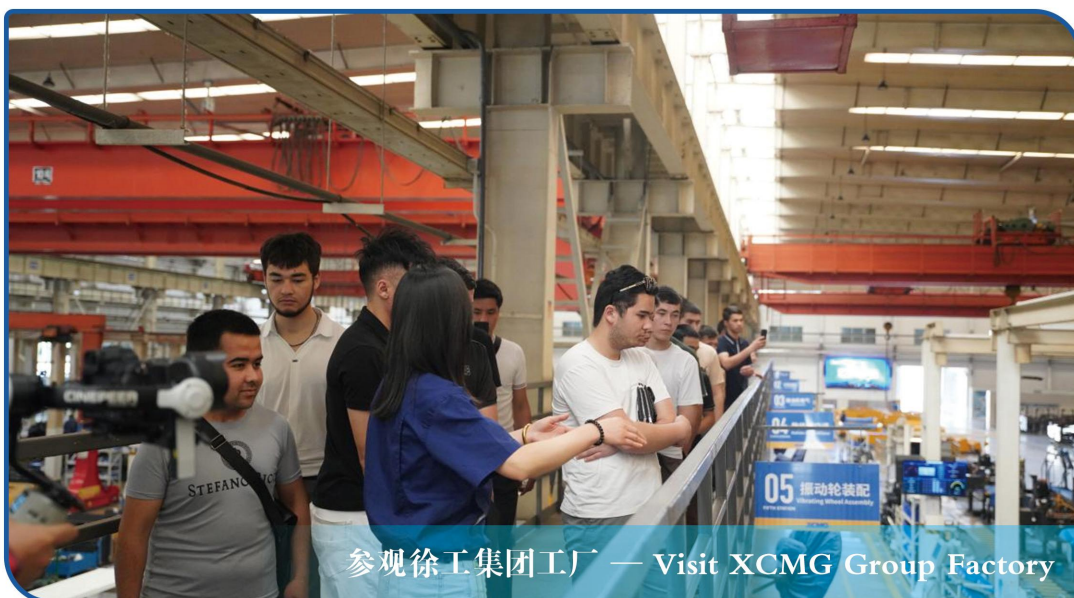
参观徐工集团工厂 — Visit XCMG Group Factory