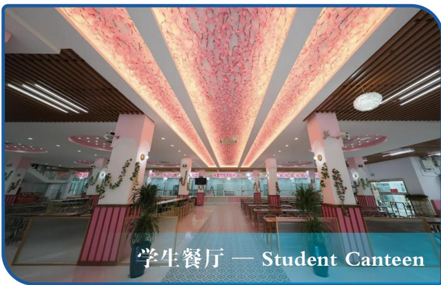
学生餐厅 — Student Canteen