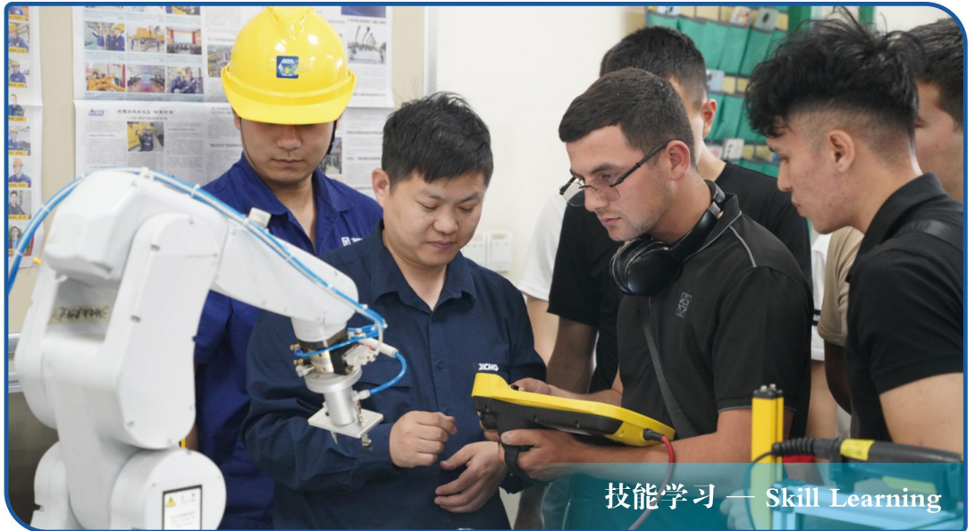
技能学习 — Skill Learning