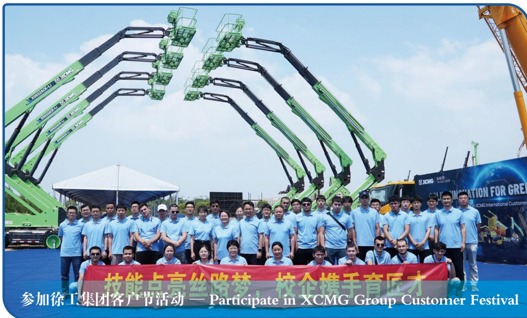
参加徐工集团客户节活动 — Participate in XCMG Group Customer Festival