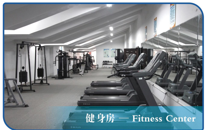
健身房 — Fitness Center