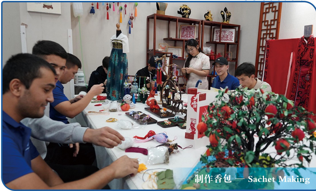
制作香包 — Sachet Making