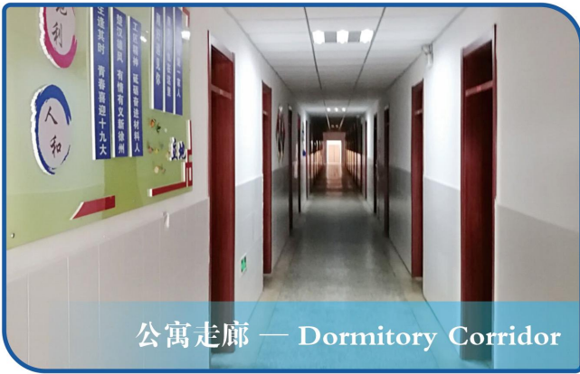
公寓走廊 — Dormitory Corridor