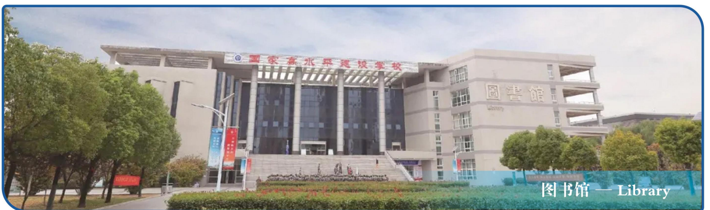
图书馆 — Library