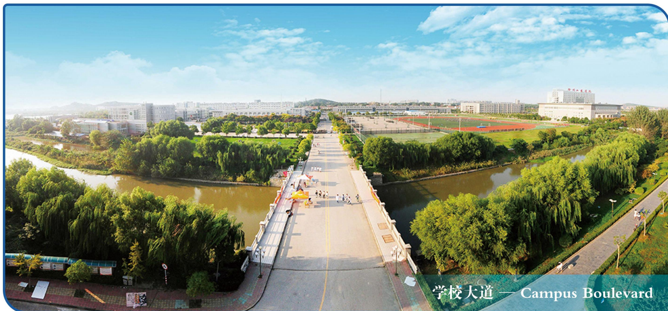
学校大道 — Campus Boulevard